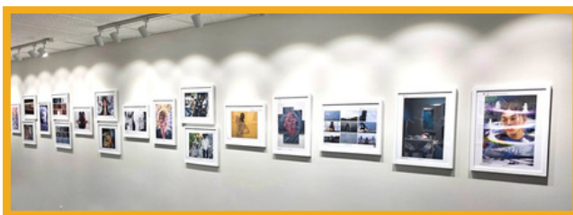
Exhibition (30 artworks showcased)