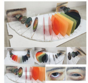
The Sides of the Color Cube By Chenyang Wang | Grade 10