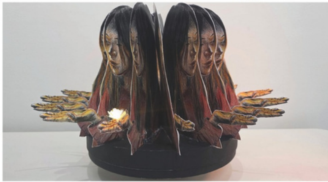
Glowing in the Dark By Chelsea Guo | Grade 11